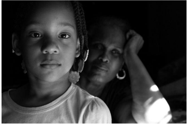
Sequoia Canada, Seven to One