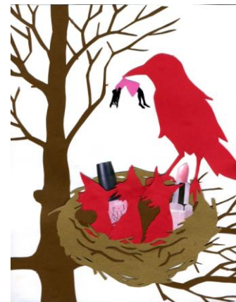
(Right) Catrina Crawford, Vultures